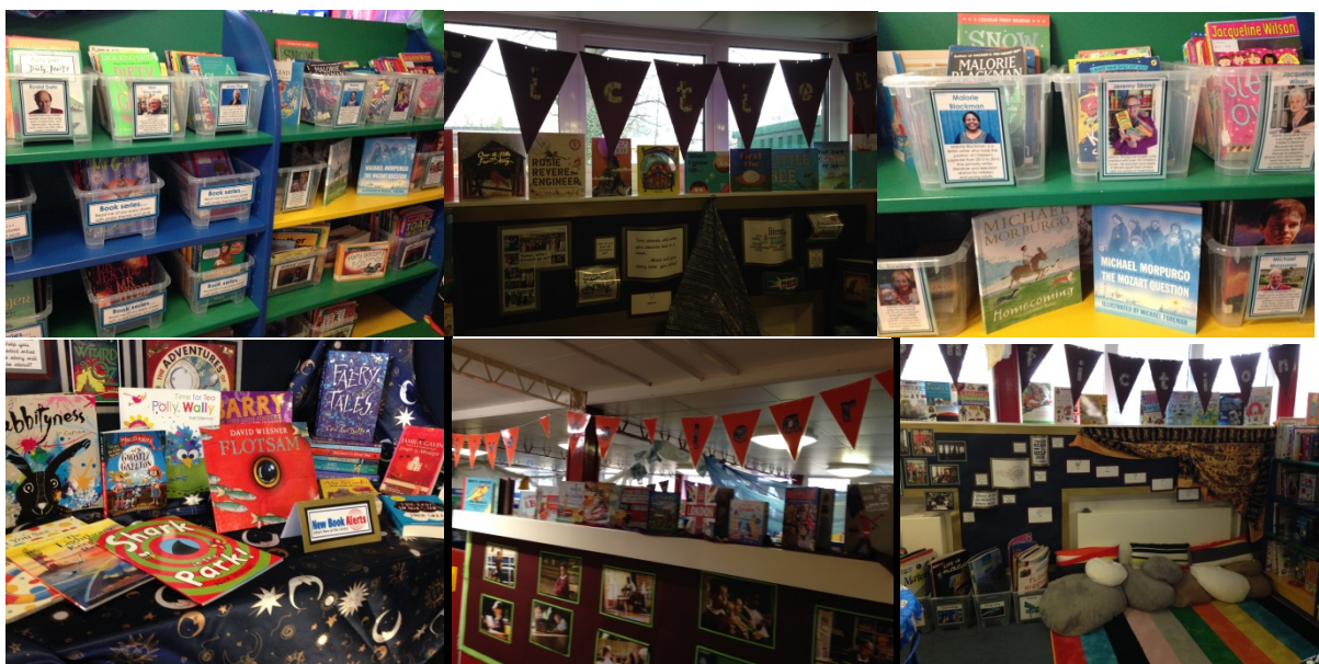
Fig.1 – School library.