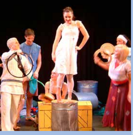
Overall satisfaction was 83% of our Final Year Undergraduates from 2015 NSS Survey.

65% of the University's graduates achieve a First and Upper Second Class degree as a percentage of all students with a classification