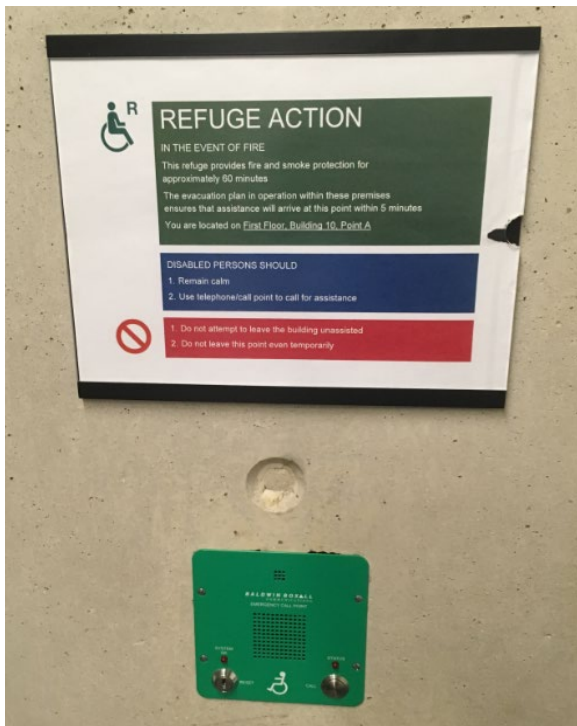
Figure 1 – Refuge intercom

Disabled individuals should note that some automatic door openers may cease to function during a fire alarm where their continued operation is deemed to present a risk in terms of the spread of fire. Should this happen, other individuals will be able to assist (building fire wardens are instructed to offer assistance where necessary).