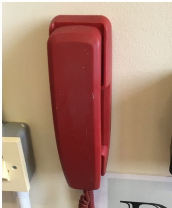
Figure 2 – Refuge telephone