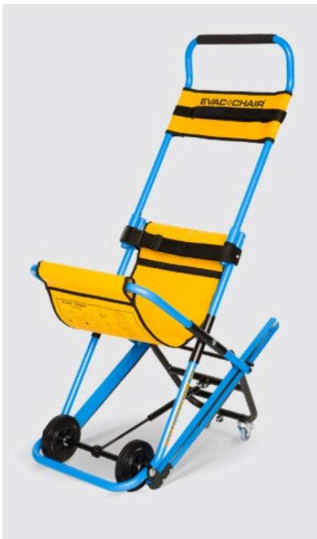
Figure 4 – Evacuation chair

The assistance of others may be helpful or necessary depending upon the level of impairment.