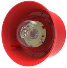
Figure 6 – Visual alarm device

these can be found within toilets which are naturally areas where those with a hearing impairment may not be able to rely upon the actions of others to indicate that a fire alarm has sounded.