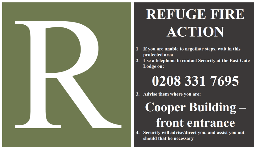
Figure 3 – Refuge fire notice where mobile phone required (other similar notices may be found – the word ‘refuge’ will always appear)