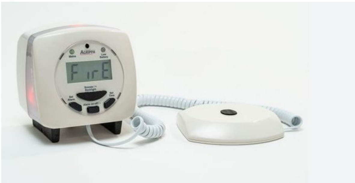
Figure 7 – Vibrating pillow alarm

For hearing impaired students that live in our accommodation, vibrating alarms will be provided. These alarms are designed to be placed under pillows and will vibrate when the fire alarm sounds.